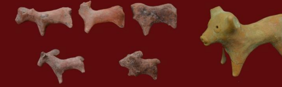
TC Animal Objects